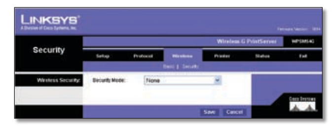
Wireless > Security > None

If you do not want to use wireless security (not recommended), select None from the Security Mode dropdown menu.